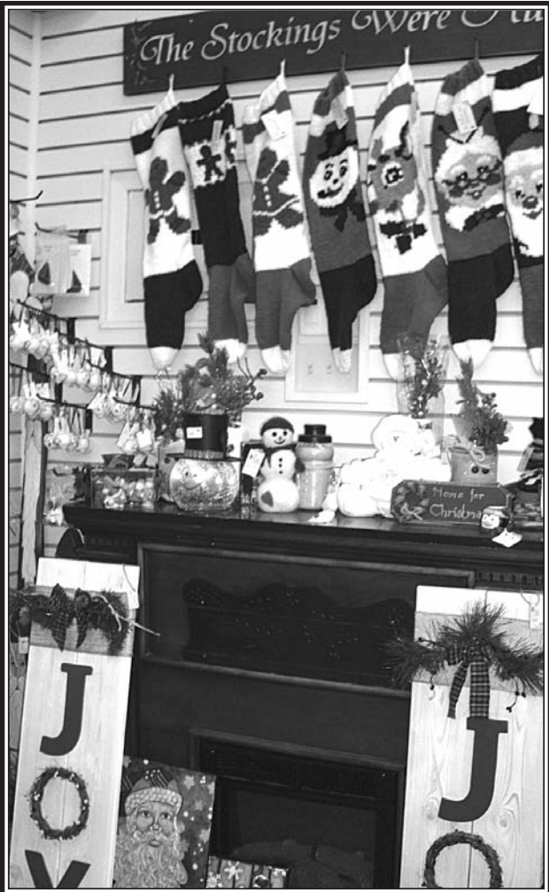
Alderberry Village has moved next door from their old location. The increased space features hand crafted furniture, an antiques and new to you treasures, and many new products. They now carry Pearl and Daisy soaps, You are welcome to the Grand re-opening on November 4th and the Customer Appreciation Day on Nov.12th. (Submitted)