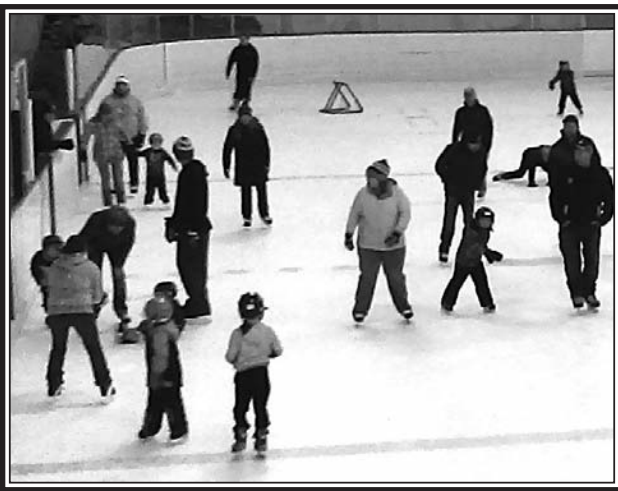
Friends and families enjoy the Sunday afternoon skates at the West Colchester Arena. Family skating takes place from 1:pm to 2:24pm. There are rental times available for Birthday parties, hockey and skating.