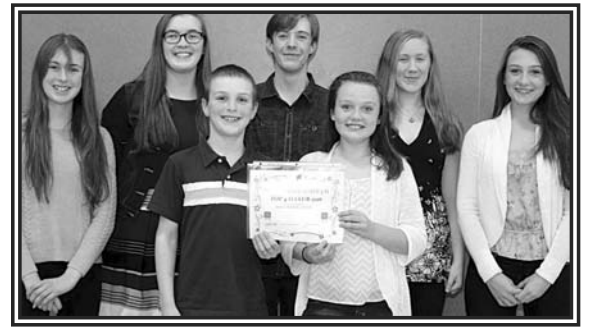
The Top Club Award was presented to Onslow Belmont 4-H Club.