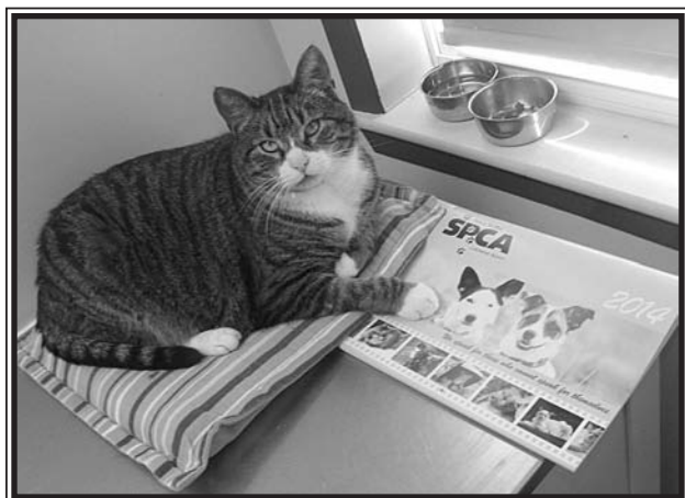
The Colchester branch of Nova Scotia SPCA is now selling the 2014 calendars. Calendars are available at the Shelter (408 Industrial Avenue), Truro Veterinary Hospital, Central Nova Animal Hospital, Fundy Veterinarians and various other businesses in Truro and the surrounding area. Calendars are priced at $10. Shown above is Cassie, a cat at the shelter.

If you wish to donate any items to our Christmas table just bring them to the shelter on or before Nov 14. Baked items, can be brought to the table at the mall on a day we are there. Use the Sears entrance. We accept all new and homemade things.