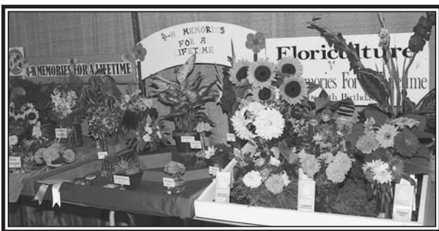
Colourful creations in the Floriculture section.