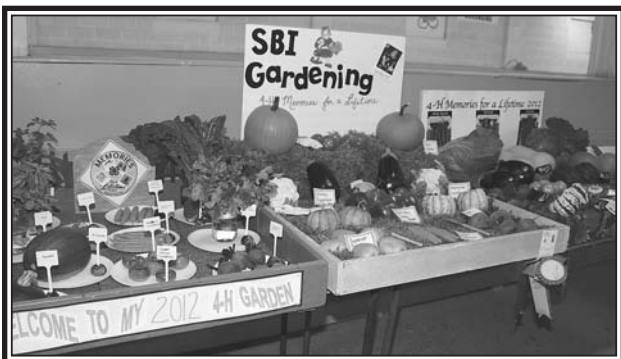
Several gardening displays.