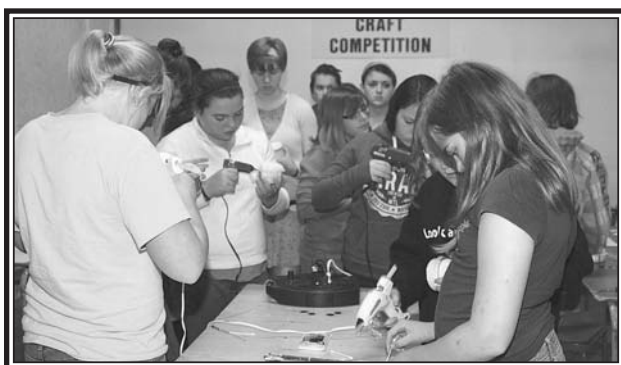
Some very intense glue gunning at the Craft Competition.