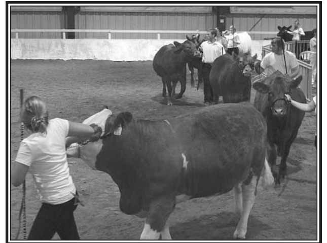
Beef cattle enter the ring at the MacMillan Show Center for the Royal Classic.