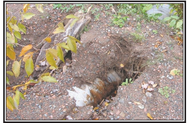
Half way through the East Montrose Road towards Londonderry motorists need to be careful as a heavy rains earlier in October have washed the road bed away from a culvert. The three holes on the roadway are about eighteen inches deep.