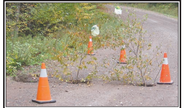
A number of pylons mark the dangerous area of the East Montrose Road, when heavy rains have washed the road bed away from a culvert. Branches from nearby bushes mark the three holes.