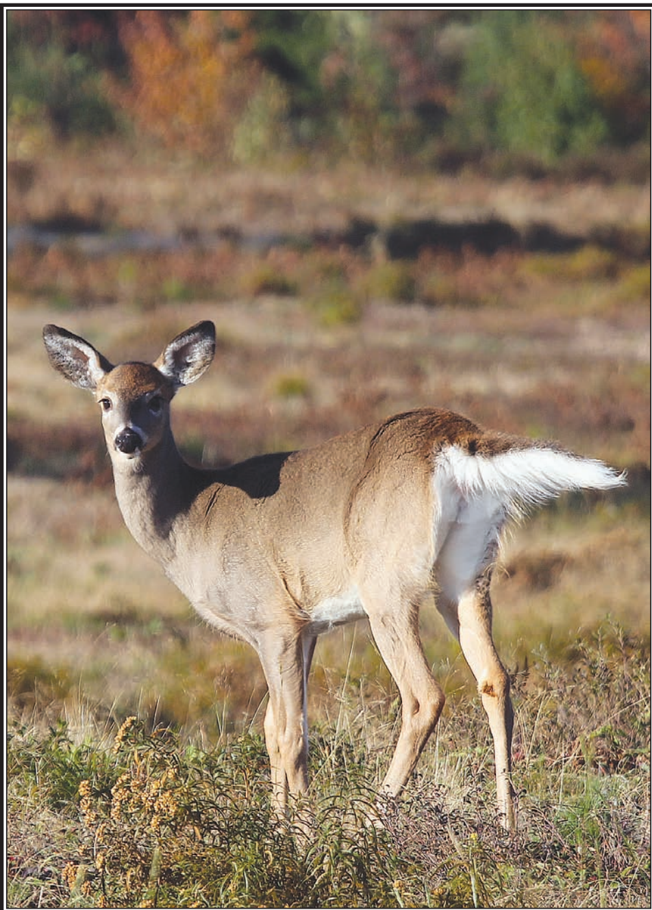
This little guy was enjoying the fall sunshine. Hopefully he takes cover before hunting season.