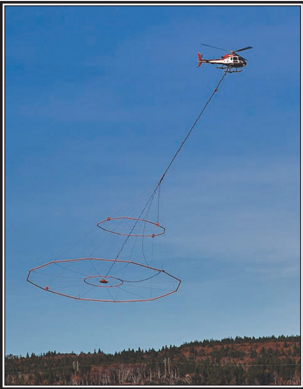
Residents of the Parrsboro area may have been wondering what's in the sky. On Wed. Oct 17th GEOTECH was scanning over the Chignecto Ridge and Farrell River Valley. The gear is approximately 150 feet above the surface to detect minerals including gold. It was an impressive piece of flying as the copter pilot maneuvered above the new power lines at Parrsboro that FORCE installed to carry the tidal power that will eventually be provided. On Thurs Oct. 18th the same crew was seen working the ridge around the Moose River Area.