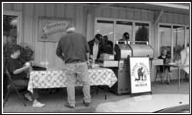
Volunteers from the Debert Military Museum were busy hosting a fund raising BBQ at the Masstown Market on Sept. 24th. Tickets were also for sale on a beautiful quilt, which are still available. Draw date Nov. 11th.