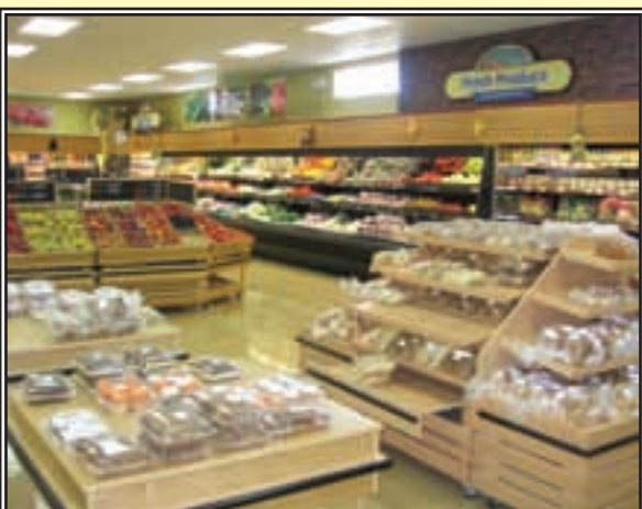
The expanded produce and meat section of Cross Roads Co-op greet customers to the renovated and expanded facility. With the expansion over 700 additional grocery items are carried in the store.