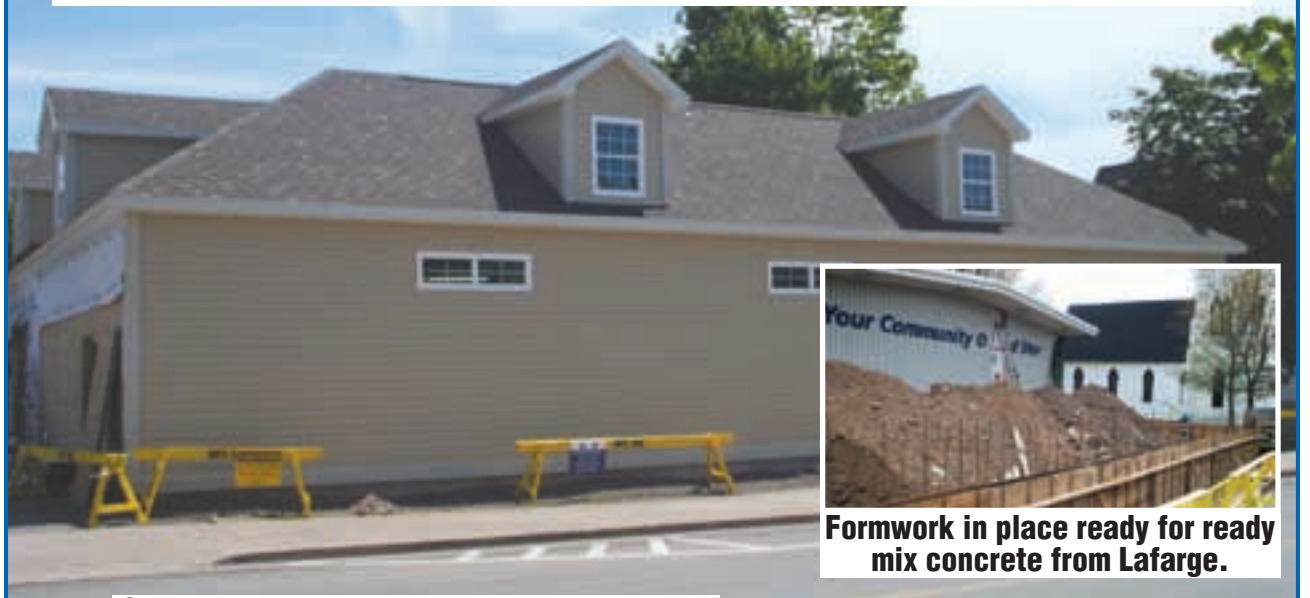
Street view before signage and landscaping.

We're proud to have been chosen as the general contractor.