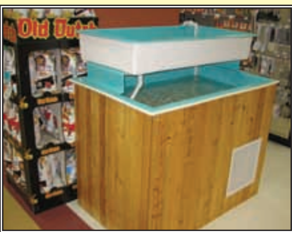
Parrsboro area residents will be able to purchase live lobster at the expanded store.