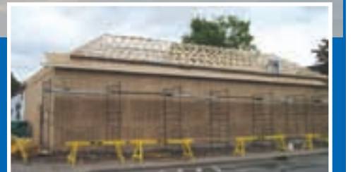
Framework almost entirely closed in.