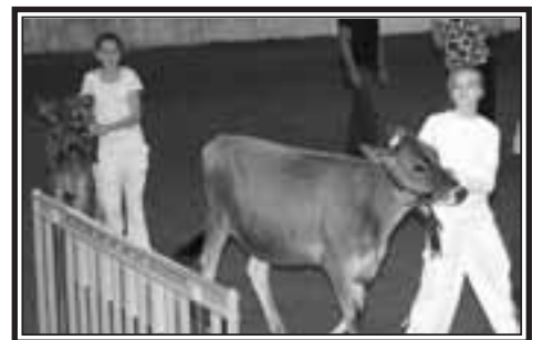
A first place ribbon was awarded to this young 4-her and her Jersey Calf.