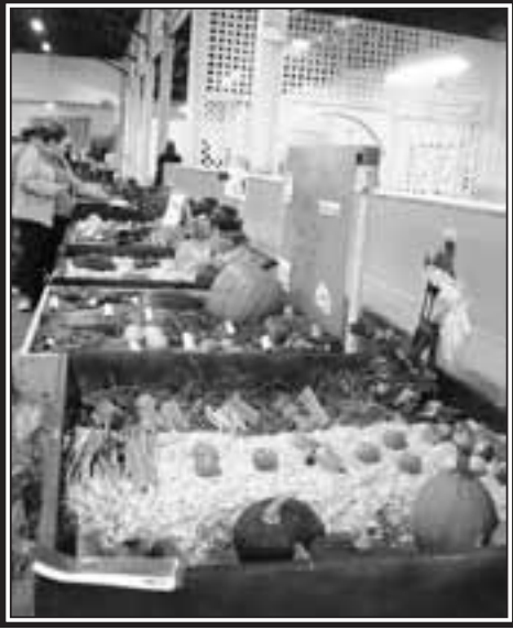
Creative vegetable and flower arrangements were on display in Life Skills Building.