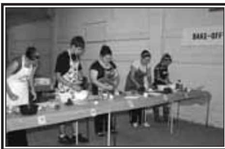
Many Life Skills Competitions were held over the three days. Senior Bake-off participants are shown making Apple Cheddar Snack Wraps.