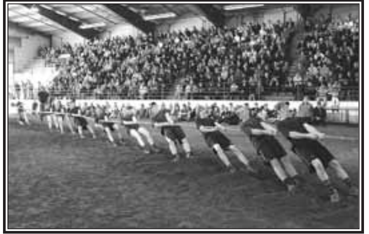
A capacity crowd watched as the Pictou County 4-H Team beat out Hants County in the Tug of War Championship Finals.