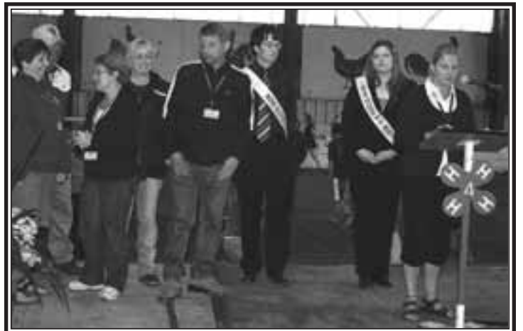
Closing Ceremonies for the NS Provincial 4-H Show were held on Sunday, Oct 3rd.