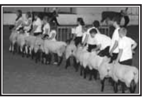
4-H members have their sheep lined up for judging