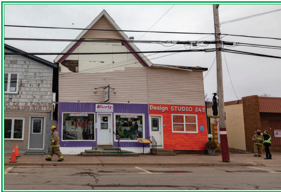
241 Main St, Parrsboro before the emergency demolition. More on page 2 and 3.

See a more detailed history of the building on Page 3.