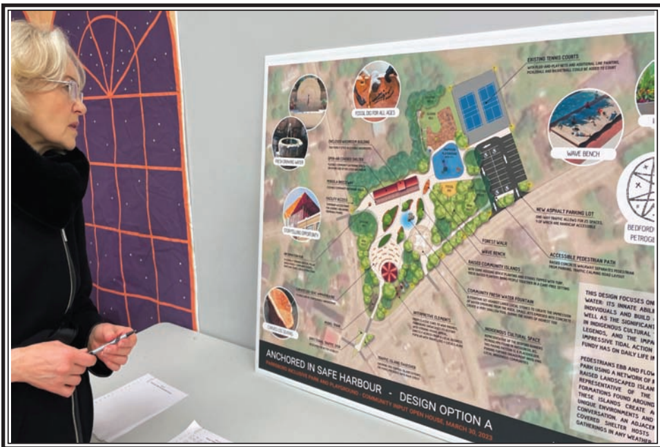
Parrsboro resident Sylvana Chambers looks over one of two preliminary design options for a new park planned on the site of the former town hall property in Parrsboro during a public meeting on Friday, April 1, 2023.