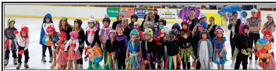
The Parrsboro Skate Club held its annual closing event at the Lions Arena on March 31st. A large crowd cheered the many skating events, and a wonderful array of costumes filled the arena in event after event. The kids had a lot of fun. Parents, grandparents, family and friends were boasting with pride.