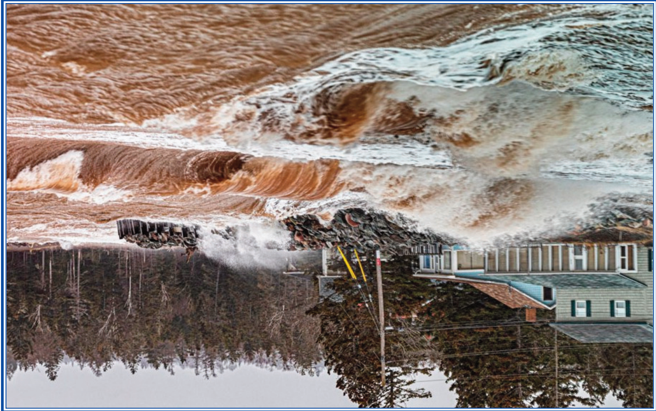
Luckily the highest tide was on April 18th two days before this photo was taken, but the onshore winds still brewed impressive waves. The cottages and beach were under attack, and Mother Nature was unrelenting.

Strategic Plan Designed to Improve Healthcare both physical and digital. To fix the problems in those areas, the plan presents six broad solutions and the objectives and actions required for each. The Province will become a magnet for health providers; provide the care Nova Scotians need and deliver; cultivate excellence on the frontlines; build in accountability at every level; be responsive and resilient and address the factors affecting health and well-being. Action for Health is available at: https://novascotia.ca/action-forhealth continued on page 4