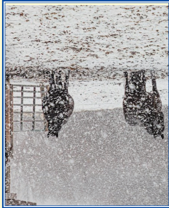
These horses seem to be enjoy an early April snowstorm. Perhaps a time to get freshened up for spring. The horses looked at me as if asking for an explanation.