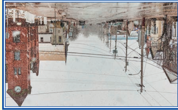
Although April Fool's Day was behind us today was quite a surprise in the intensity of the snow and windstorm. It might not have required snowplow operators, but this early April storm created some dreary conditions on Main Street, Parrsboro.