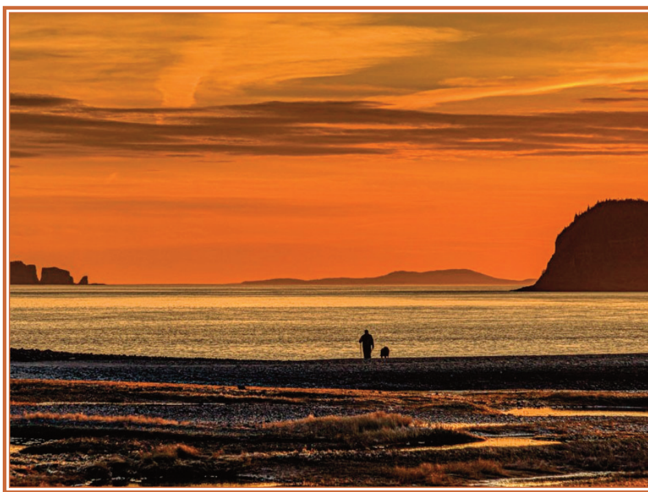
A beautiful sunset greets this beach walker looking at Partridge Island.