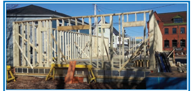
Within four days at the end of the week, framing for the walls was erected awaiting the second storey floor system.