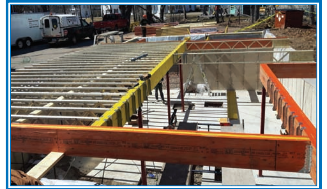
It didn't take tradespeople long to install the flooring system for the ground floor of the new bakery.