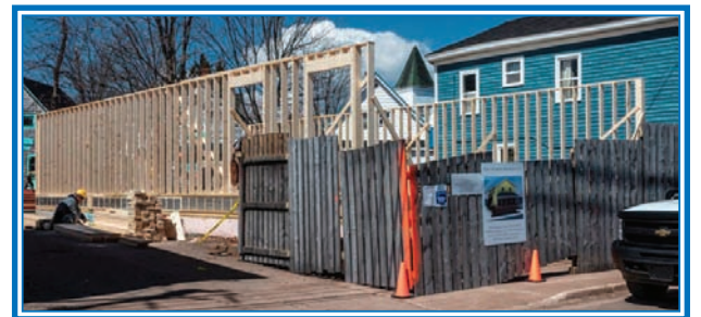
The landscape of Main Street Parrsboro is changing with the erection of the first floor walls at Two Island Brewing company taking shape on April 13th.