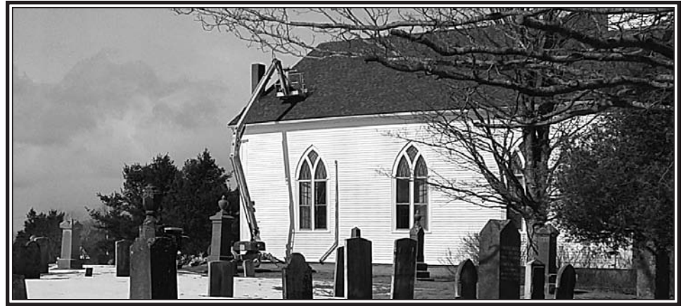
A portable lift was used recently to check the roof, chimney and flashing at the United Church, Glenholme.

https://jobs.novascotia.ca/go/Entry-Level-Opportunities/503017/