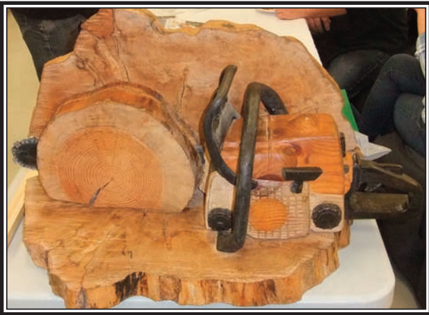
You might not cut much timber with this wooden chain saw, but it would be a great memento of hours of work with a chain saw in your hand.