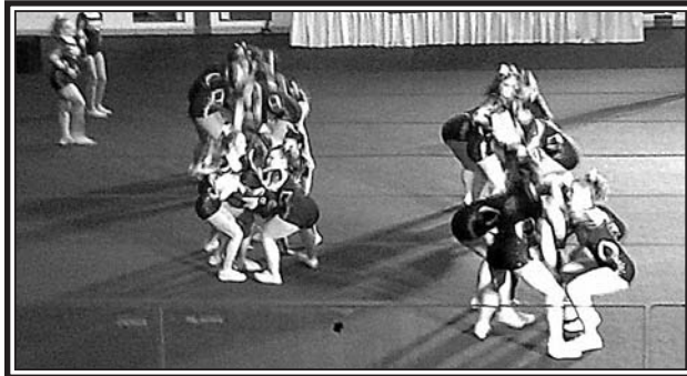
Hundreds of boy and Girls took part in the Nova Scotia Cheer Competitions at the Rath Eastlink Centre.