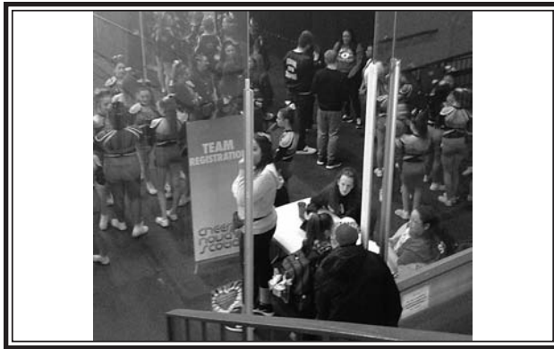
Groups gather behind the curtain to get ready for their next performance at the Provincial Cheer Competition in Truro on April 21.