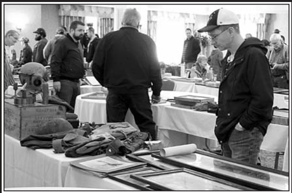
Over 75 tables of displays were set up at the Maritime Military Collectors Show, featuring everything from books and medals to guns and uniforms.