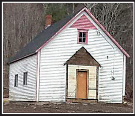
The Fraserville Hall prior to major renovations.

Fraserville Community Centre, located on Hwy 209 was once a one room school house. It is now ready for it's May 6 Re-Opening. See story on Page 4.