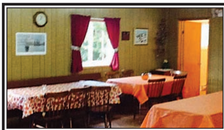
Inside is done, just a few touches inside to be ready for the May 6th re-opening.