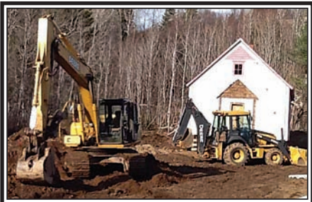
Excavator prepares area for a new foundation.