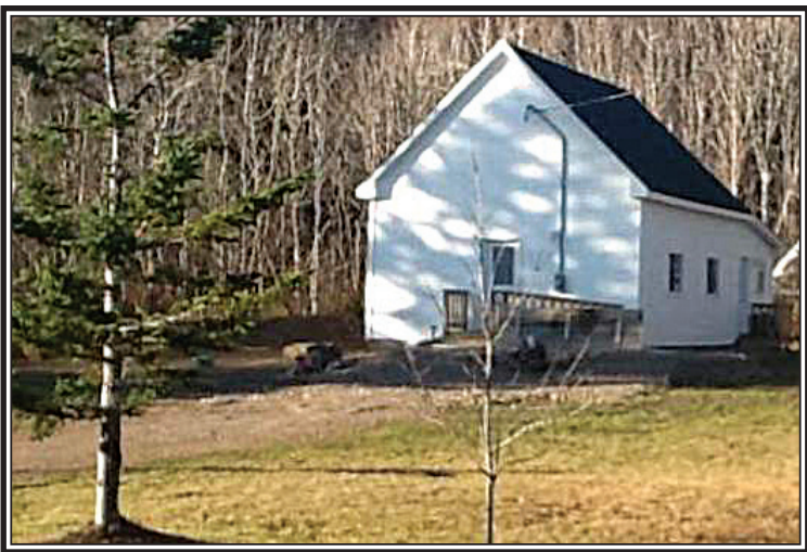
All finished and ready to be used. Like my new look?