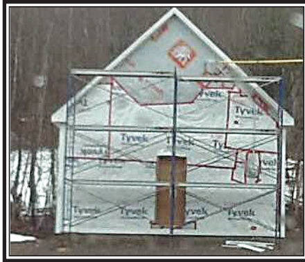
All wrapped ready for new siding.