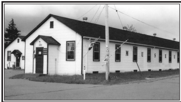
The Debert Military Museum, located at 35 Acadia Ave, Debert will hold a season opening event on Saturday, May 30th beginning at 11AM. The Museum will be open Tuesday- Sunday, May 30th to Sept. 27th from 10AM- 4PM, or by appointment.