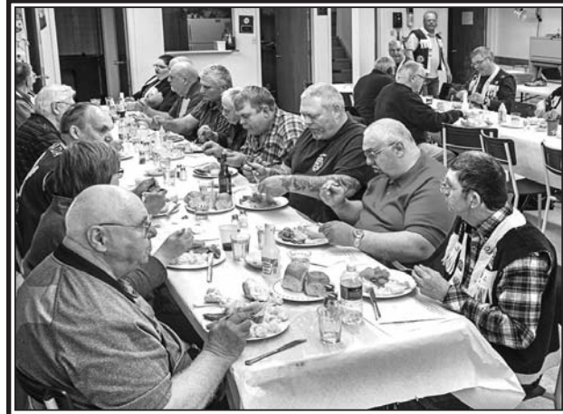
On April 16 the Parrsboro Lions Club invited the Works employees to join the Lions Club for dinner, as a thank you for their hard work with the never ending snow.

To Enter: Register the day of the event or for advance registration download the form, fill it in and mail it to: Not Since Moses, 44 Eagles Loop, Lower Five Islands, NS B0M 1N0. http://www.notsince-moses.com/