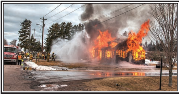
At the training practice burn on Farrell Road, Cumberland Fire Fighters hold back the heat from the hydro wires creating a water curtain.