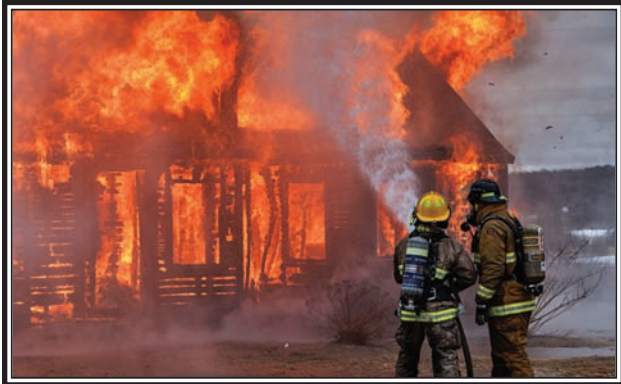
It wasn't an accident. This fire scheduled training practice fire gave younger fire fighters an opportunity to practice how to learn the various techniques employed to control or put out a fire.