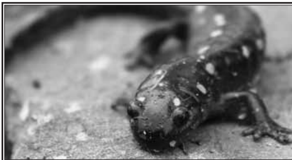
This little spotted salamander thought it was warm enough to come out to sun itself on one of our rare sunny days this spring.

Next meeting is Tuesday May 3 at 7 PM. See you there!