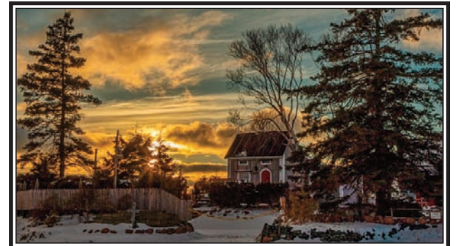
Winter can be wonderful, here's 'The Little Cottage on the Beach'