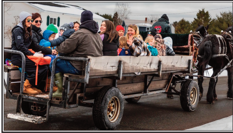
Everyone enjoys an old time 'Horse Drawn Sleigh Ride'.