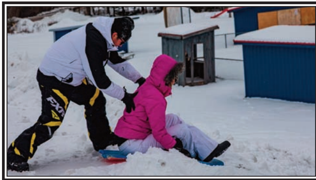
Ok, it keeps snowing for a while so .... Wow, get the whole family out and go sledding !! Parrsboro, NS