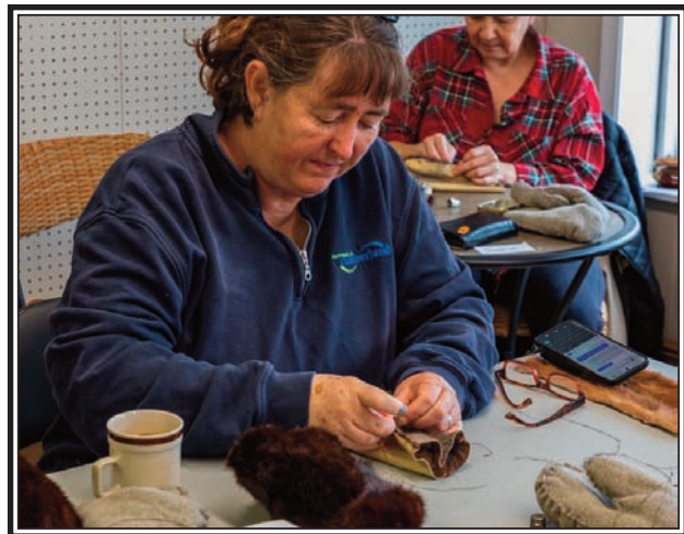
Trying a new and useful skill, 'Inuit Mitt Making'