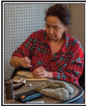
Love these Inuit Mitts