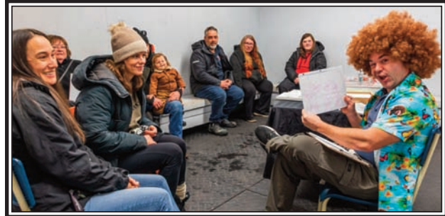
A great laugh while doing some 'Caricature Drawing'.