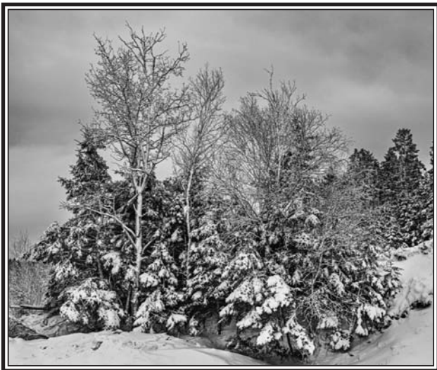
The night snow covered the trees making a winter wonderland.