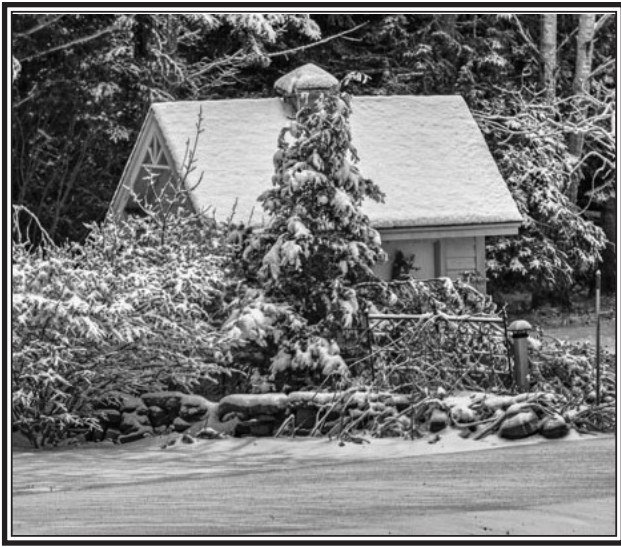
The little cabin hoped for company, but none came.