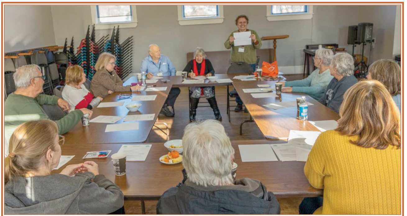
The Parrsborough Shore Historical Society hosted an afternoon of refreshments and games at the FPW Fire Hall in Port Greville on January 31. The event was made possible through the Government of Canada's New Horizons for Seniors Program.

Members of the Board were ecstatic with the response - "We are so happy we could put this together, sometimes it is nice to slow down and enjoy an afternoon with friends" "We will have two more events one in February and one in March and encourage everyone to watch our social media page for the time and place." Parrsborough Shore Historical Society can also be reached at ottawa.house@ns.sympatico.ca