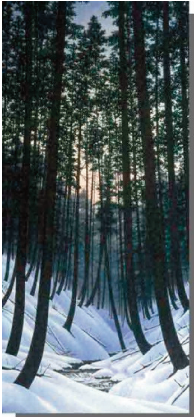
A typical winter view from deep in the forests of Portapique River Wilderness area will continue for eternity with the Provincial focus on keeping pristine and adding additional areas.

ences sheltered from the sights and sounds of surrounding land uses. There are currently no managed hiking or backcountry ski trails in this wilderness area.