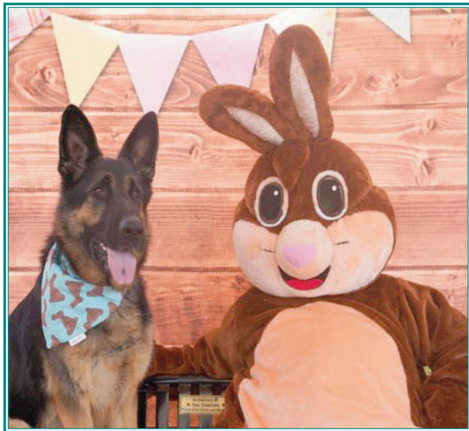
Easter is around the corner. As explained in an advertisement elsewhere in this issue The Downtown Truro Partnership offers a photo with the Easter Bunny opportunity.

Elections Nova Scotia (ENS) has awarded a contract through the Nova Scotia tender process to ScytI Canada Inc. (ScytI) to develop an internet voting solution.