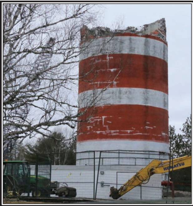
Last month, we published a picture of the new tower, in error. We apologize. The iconic water tower at the corner of Plains Rd and MacElmon Rd in Debert has been demolished. A new tower was built a few years ago further along Plains Rd.