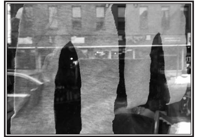
Alderberry Village on Inglis Place in Truro, had a unique line on long johns decorating their window for the Winter Long John Festival.