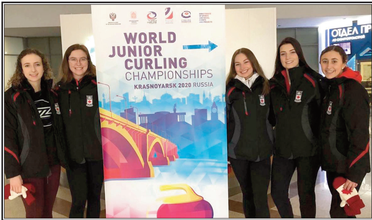
Canada's Junior Curling Team is pictured with the pop-up display in Krasnoyarsk, Russia prior to winning the world title by defeating South Korea, 7-5.

The Shoreline Journal WELCOMES YOUR STORY CONTRIBUTIONS