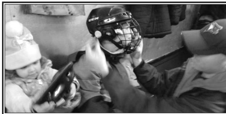
Participants get ready for the Sunday family skate at the Colchester Legion Stadium. (Submitted)