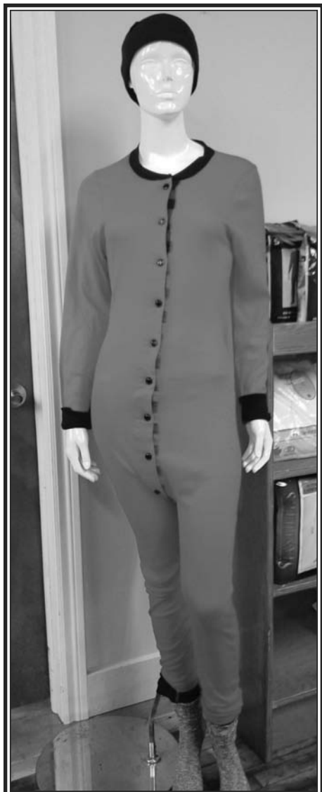
Stanfields Factory Outlet keeps you warm all winter in their famous long johns. (Submitted)