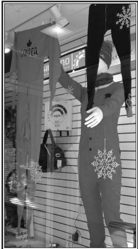
Stanfields Factory Outlet keeps you warm all winter in their famous long johns. (Submitted)