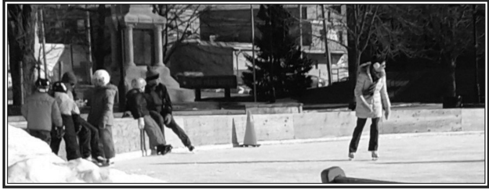
Skaters enjoy the rink at Civic Square in Truro during the Long John Festival.