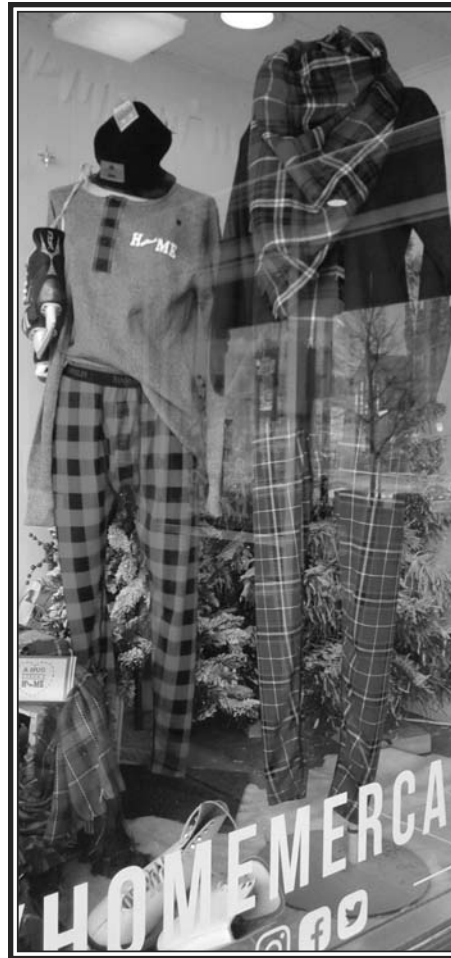
The Home Mercantile on Inglis Place promotes Nova Scotia and the Long John Festival.