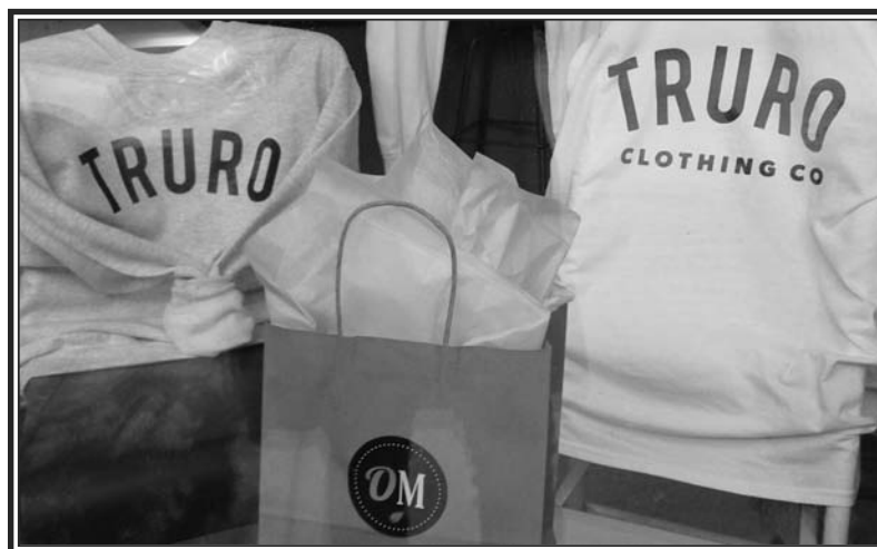
Promotion of local products appeared in many store windows as part of the Long John Festival. (Submitted)