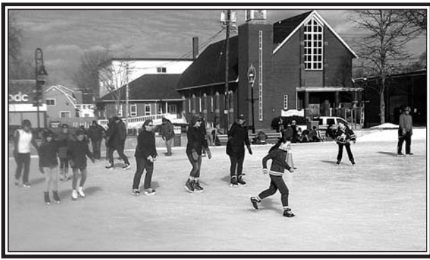
Skaters took advantage of the weather on the last day of Long John Winter Festival to skate at the Civic Square rink.