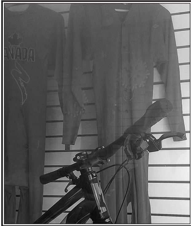
Hubcycle on Inglis Place had the long johns and the big bikes in their windows to promote Long John Winter Festival.