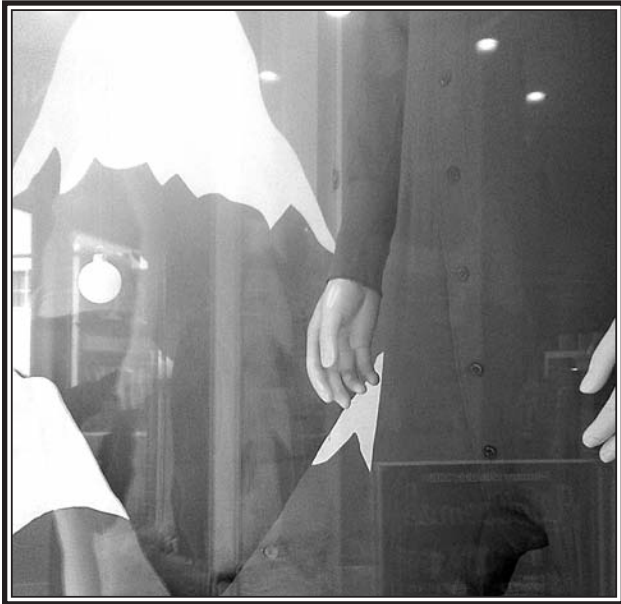
Take It Outside, Inglis Place featured mountains as a nice backdrop for the long johns as part of Long John Winter Festival.