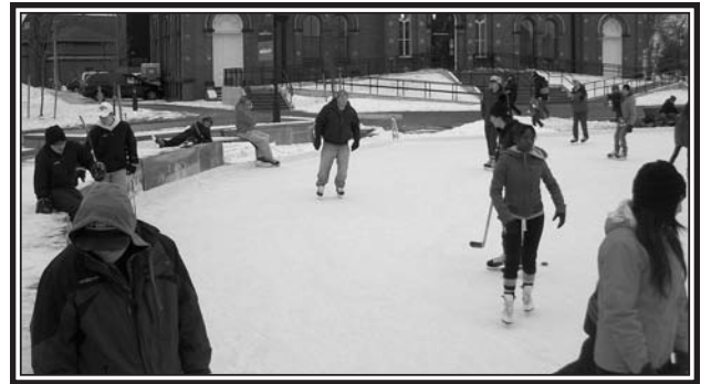
During the Long John Festival there was lots of outdoor and indoor skating.