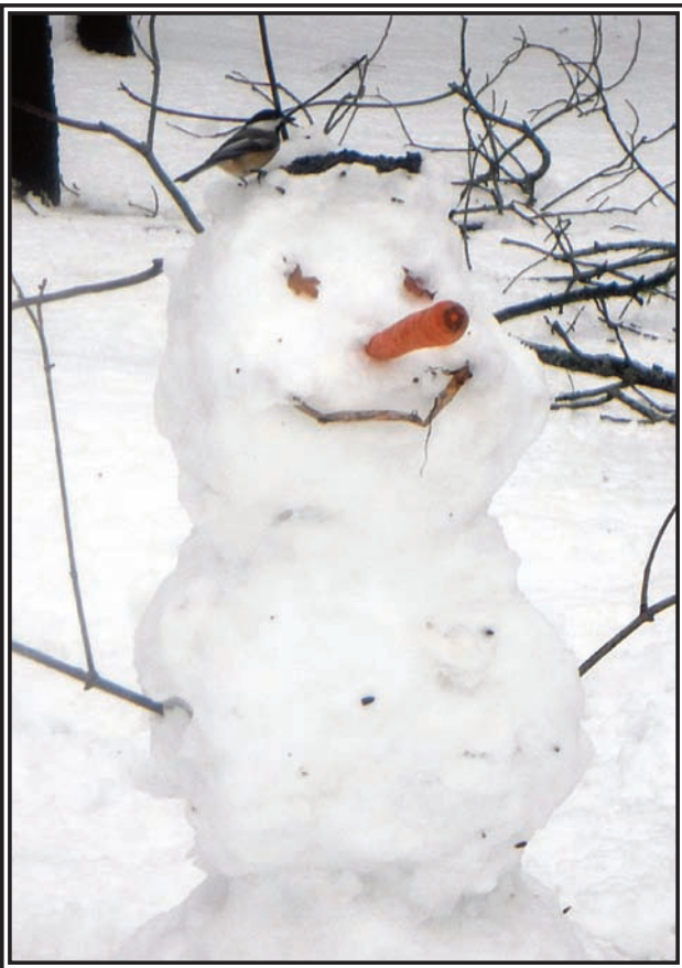
A chickadee makes a fine hat decoration for the happy snowman.