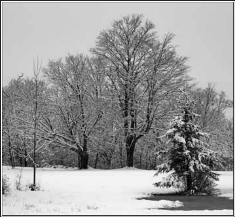
Landscape Photographer captured the beauty of a Snow Day in Parrsboro.

The search committee is meeting and will soon be looking at candidates for the position of full time ministry for the charge. I understand they have at least seven applicants who are interested in leading our congregations in worship, and being a part of our shared communities. Hopefully, a minister will join us come July. Until then pulpit supply will be used.