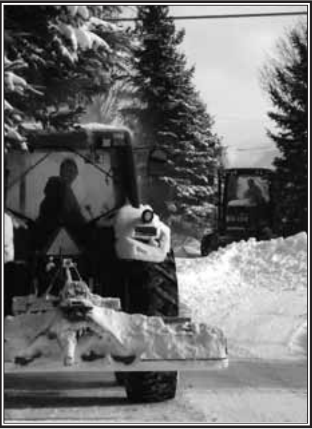
Evan Jennings and Keith Smith were busy plowing out driveways on the Little Dyke Road following the Ground Hog Day snowstorm which dumped two feet of snow locally and resulted in the cancellation of school for two days.