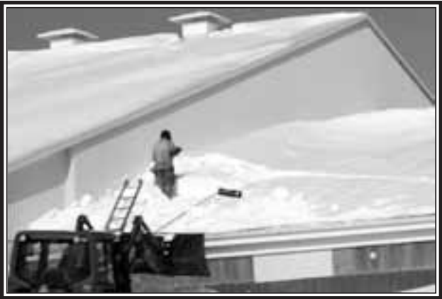
Hard to get a plow up here! The piles of snow on the ground have been hard to deal with but as the inches continue to accumulate many are worried about the added weight on the roof as well.