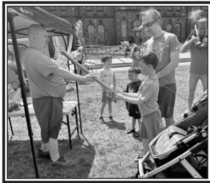
Balloon animal station