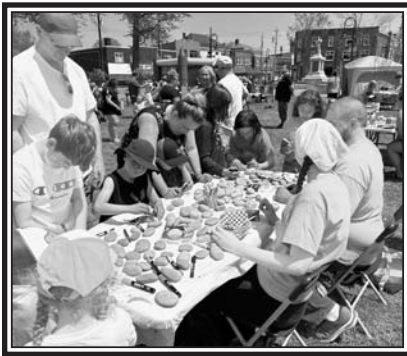
Rock painting station.