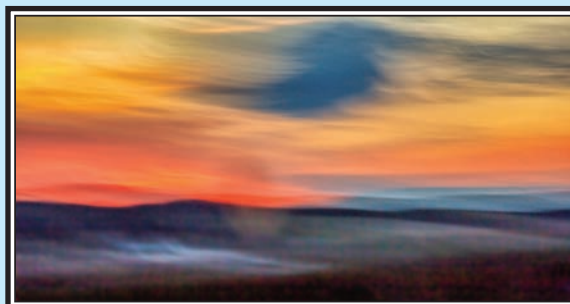
Sunset in the other world