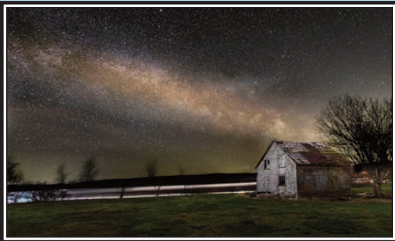
Newville Lake -MILKY WAY: as seen through the lens of Lawrence R Nicoll. More below...