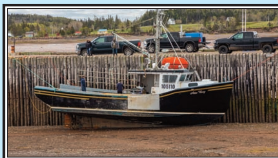
Drydock style at Parrsboro