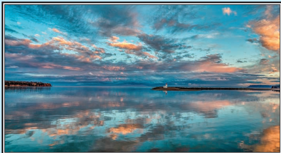
Parrsboro Harbour Lighthouse