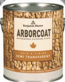
ARBORCOAT Semi Transparent Classic Oil Finish