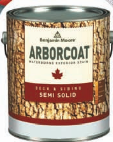
ARBORCOAT Semi Solid Classic Oil Finish