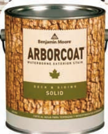
ARBORCOAT Solid Deck and Siding Stain Solid Waterborne Stain