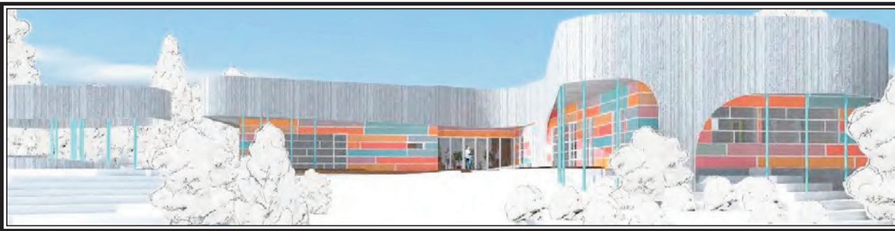
View looking west to the NSNW office wing from Treaty Connector Extension. (Submitted)