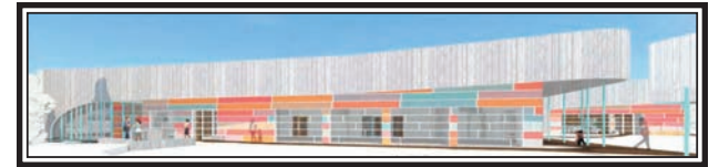
View to the Resilience Centre from the Dance Courtyard.