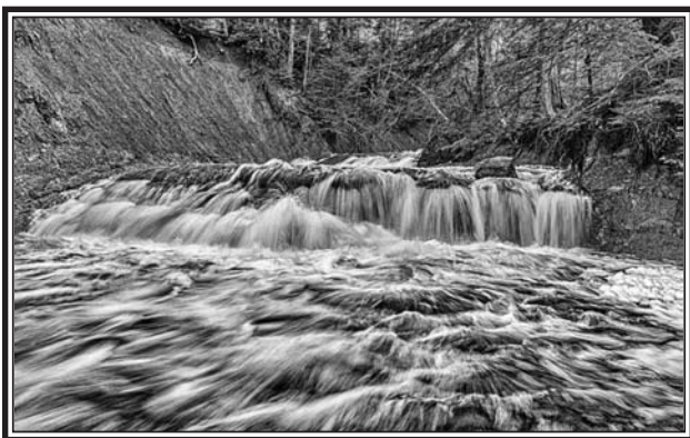
After the April 4th storm the added water created a wonderful scene at North River near Five Islands.