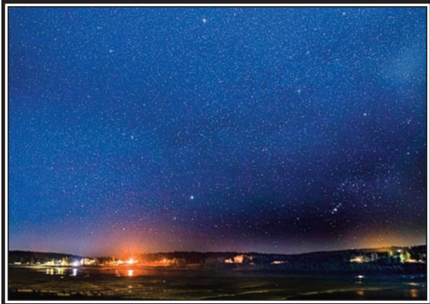
You have to live away from the big city to appreciate the magnitude of stars in our sky. Even Parrsboro has enough darkness to show the magnificence of the night sky.