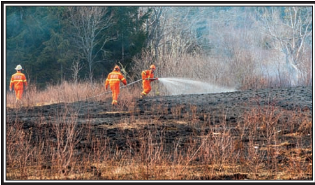
At 16:04 March 31st the grass fire season officially began when a fire to burn refuse spread to grass and rapidly grew at 4487 Hwy 2 – The Sunshine Inn. Parrsboro Fire responded promptly and was aided by the lake and stream that surrounded the burn area. Fire was put out quickly, but there is a reminder although burning may be permitted after 2:00 pm, it should be done safely and at a time when the wind is low.