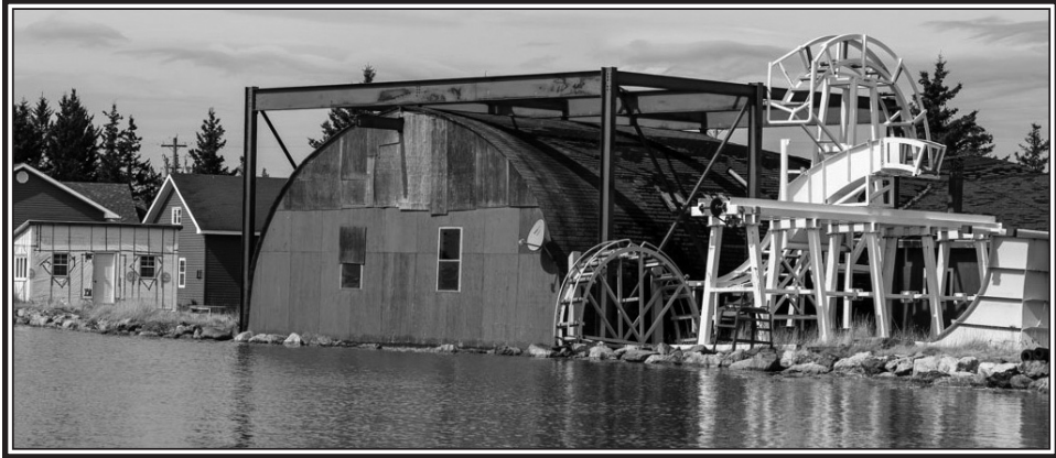
Overnight April 9th the storm really took over pushing water over the road entirely, onto the wharf. The protected inner parts of the harbour took about two feet off the embankment.