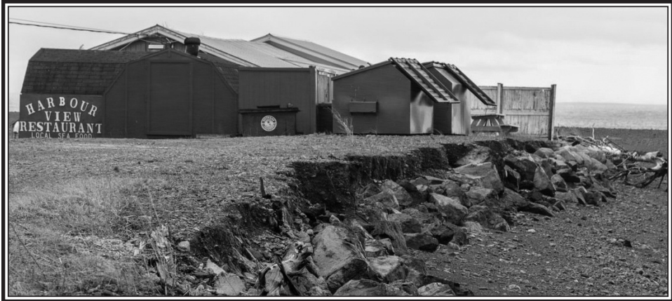
The Parrsboro Harbour behind the Harbourview Restaurant at low tide.