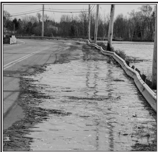
On April 9th with spring high tides during the day the tide rose onto Two Island Rd and up to the base of the lighthouse and buildings at the beach.