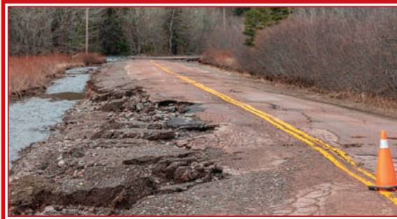
If the water didn't wash out culverts, it sure plays havoc causing pavement to disappear leaving only part of Smith Hollow Road passable.