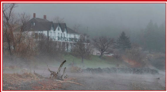
The view of the Bay of Fundy was practically nil from Ottawa House during the morning with heavy fog.