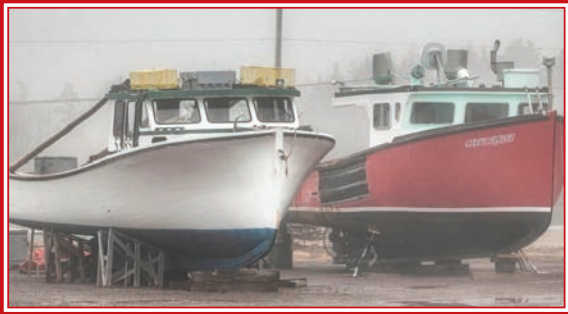
Boats in Parrsboro Harbour took on a surreal appearance as fog enshrouded the Parrsboro area on May 2nd.

Water, Water, Water everywhere. And Fog! Love Maritime Weather