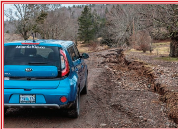
Motorists has to be careful driving to their property off Prospect Road.