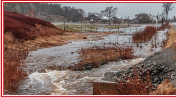
The house and farm building on Hanna Road didn't get flooded, but there was lots of water in surrounding fields.