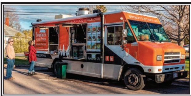
As the day comes to a close, the last customers of the day wait for their meal from the Bangkok Food Truck. I have tried their menu on a number of occasions and it is refreshingly different, and very tasty. As usual the truck was well attended the whole day, hopefully leading to future visits.

is proud to provide coverage of community events.