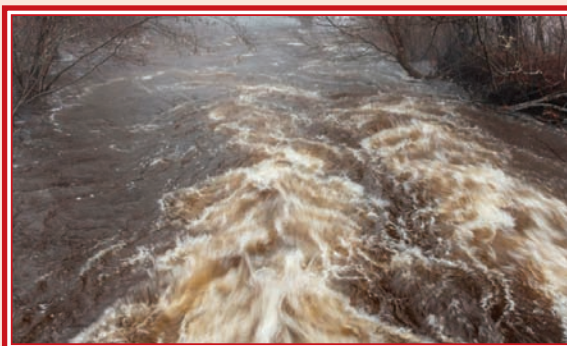
There was lots of water flowing through Lakelands. Anything in its way would be moved or damaged quickly.