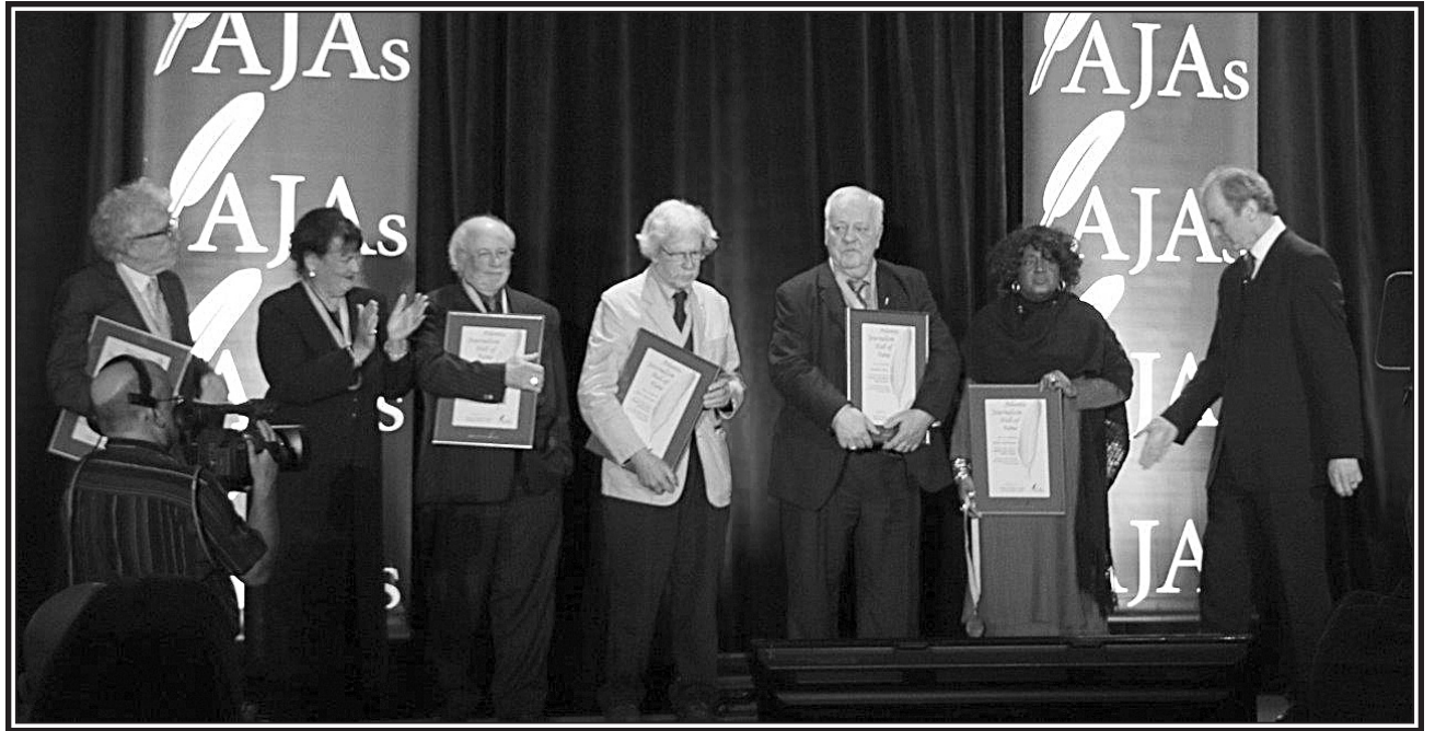
This year's Atlantic Journalism Awards marks the first to see 6 amazing Atlantic Canadian journalists inducted into the hall of fame, congratulations to you all.