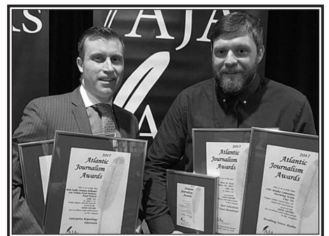
CBC NL wins 4 gold, 1 silver at the Atlantic Journalism Awards.