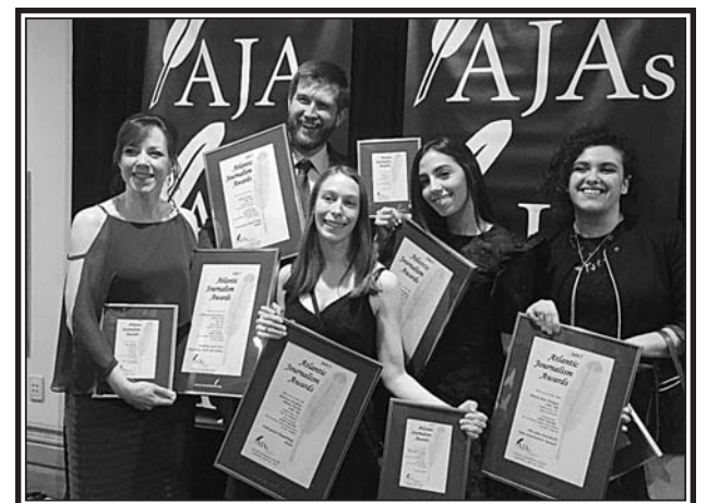
A great @CBCNL crew at the Atlantic Journalism Awards.