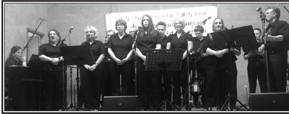
The Cumberland Singers performed a wonderful concert at the Wentworth Recreation Centre to raise funds for animal shelters.