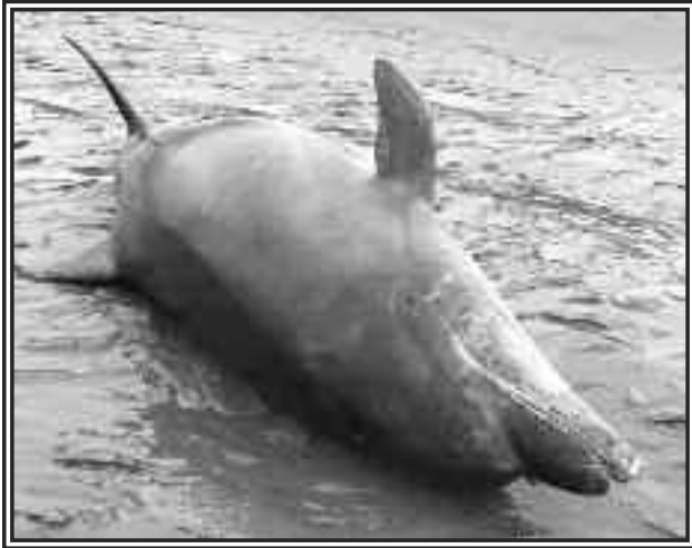
A dead bottlenose dolphin was found May 7th on the shoreline of the Shubenacadie River, near South Maitland near the Tidal Bore lookoff. It was a 10ft pregnant adult female. An on-site necropsy was performed by MARS staff. The cause of death has not yet been determined.