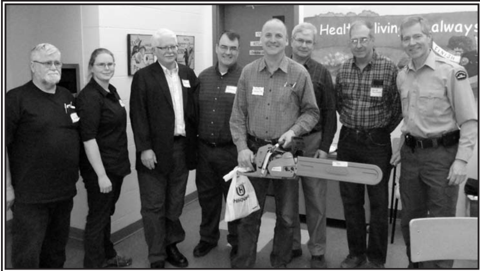
Members of the organizing committee of 2017 Woodland Conference, Central Region gather around the winner of the chain saw.