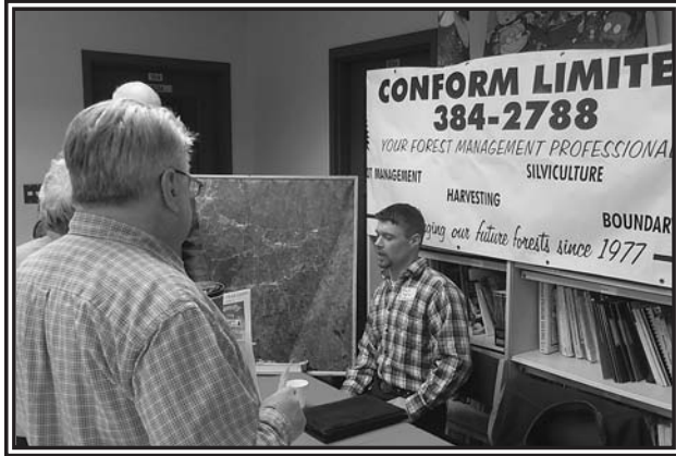
Local forest management company, Conform Ltd, participated in the trade show and also supplied their CEO at a speaker. The company was also a sponsor of the conference.