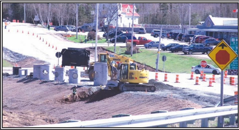
It's been turmoil for motorists at the intersection of Highway 104 and Highway #2 at Masstown Market with construction of the new "roundabout" and the widening of Highway #2 between Masstown Petro-Canada and Masstown Market. Widening of Highway 2 is supposed to be completed at the end of May with the roundabout at the end of June.