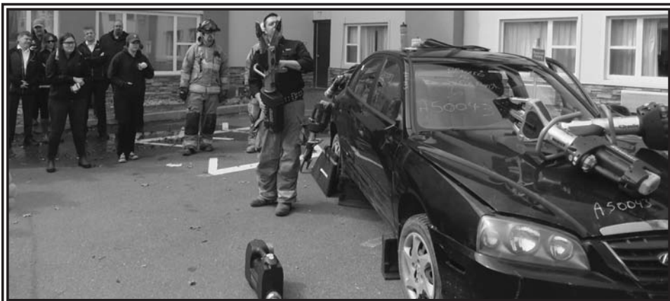
With all the equipment in place this car will soon look much different after a demo on how to remove victims from a vehicle following an accident.