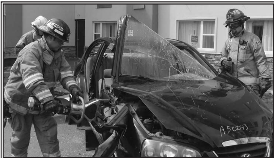
Showing firefighters how to lift the dash to remove a victim from the passenger seat.